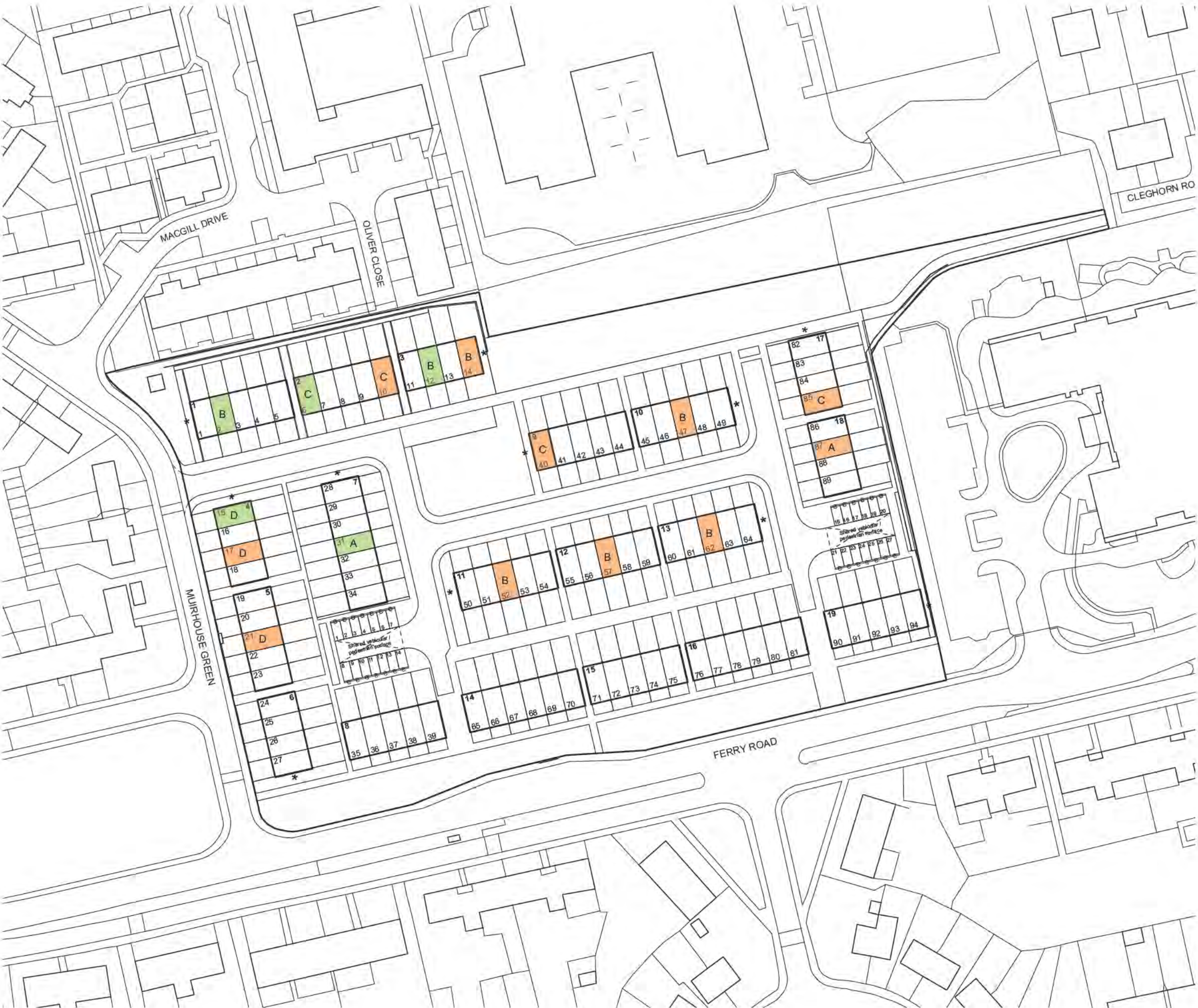
Proposed Plot Testing: Acoustic & Air Tightness Scale: 1:1000